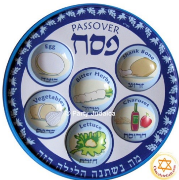
Second Night Passover Seder Thursday, April 9, 2020