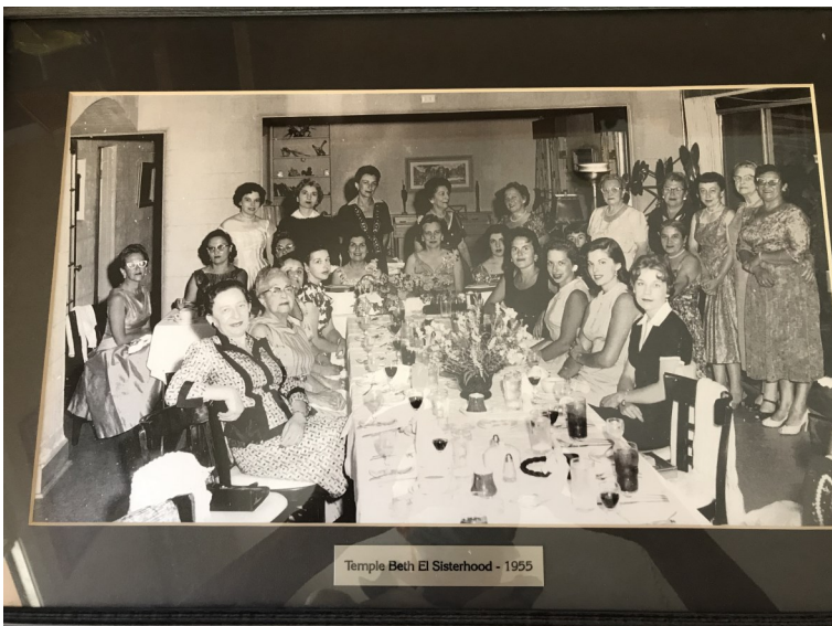
Temple Beth El Sisterhood - 1955

PS. Looking forward to when the Covid situation improves and we can get together and celebrate the history of 65 years of Sisterhood.