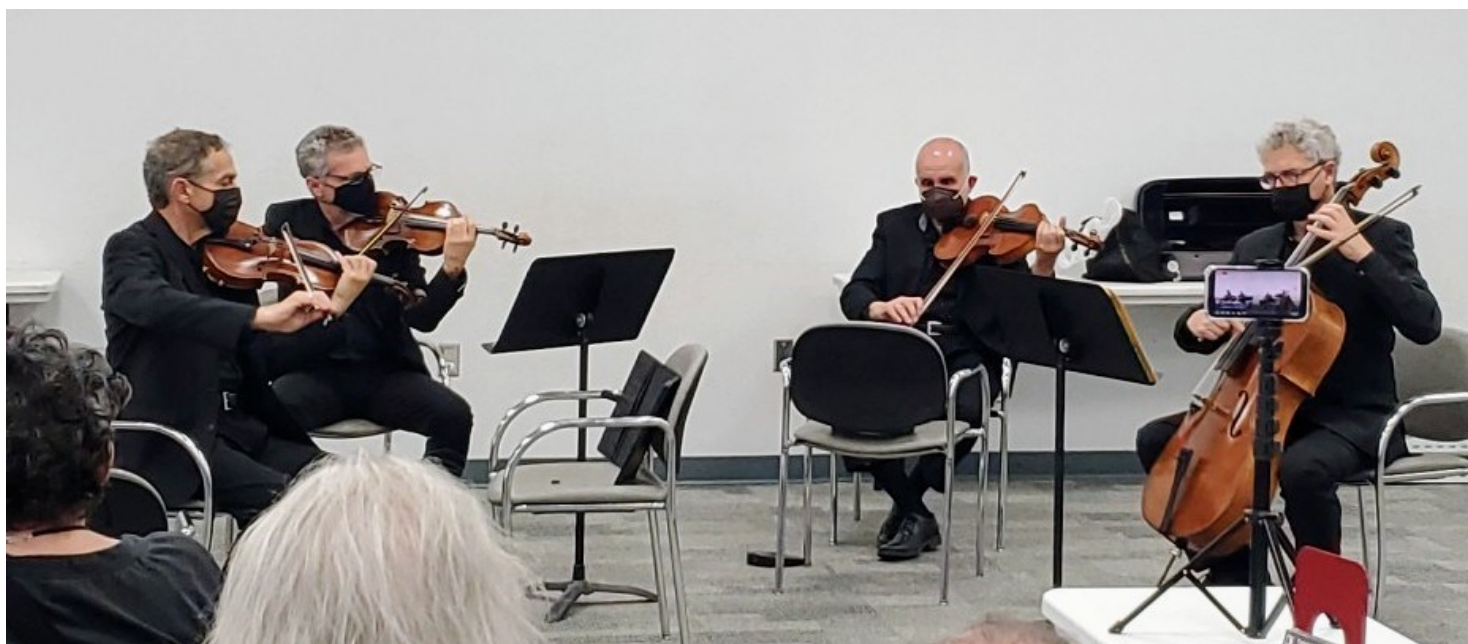
Cuarteto Latinoamericano at the December 10th meet and greet at the Thomas Branigan Library, co-sponsored by TBE's Adult Education Committee