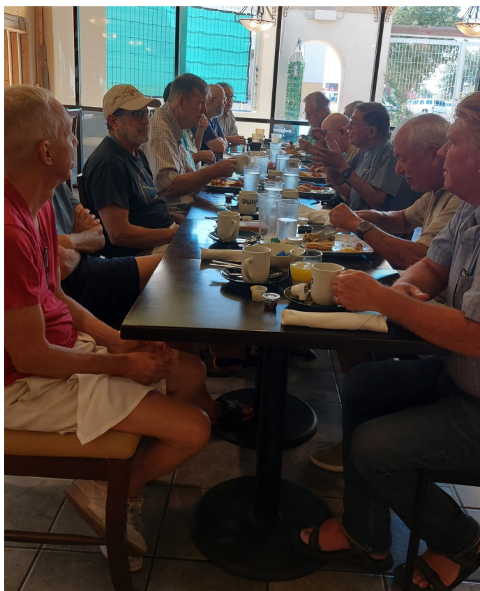
A great turnout for Mensch breakfast on September 4.