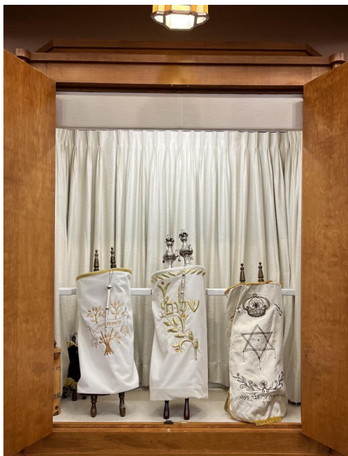
Our Torahs in their High Holiday Mantles

Today I brought 312.4 lbs of food to Casa De Peregrinos donated by our fantastic congregation. This brings our yearly total to around 825 lbs. Thank to everyone and let's keep it up..Tikkun Olam!!